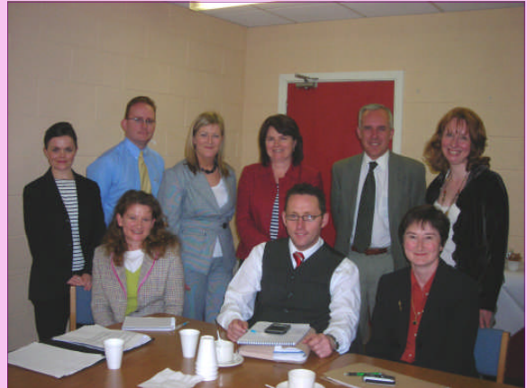
Communications Task Group

It is widely acknowledged that no one group or individual can successfully tackle health inequalities. We, as a project group, recognise the need to form partnerships with all the groups, organisations and individuals across the regions that have a direct role to play in alleviating health inequalities. We acknowledge that many people are already doing excellent work in this area and have significant experience in tackling health inequalities. Our aim is to work together with all these people to develop a long term strategic plan for the border area.