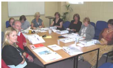
Vulnerable Adults 'Train the Trainer' session in Navan, Co. Meath

This project continues its work of increasing the knowledge and skills within learning disability services, on the issues associated with adult protection. So far 134 people from across the CAWT border region have attended 'Train the Trainers' sessions designed to increase service user understanding of relationships and personal safety, as well as training service managers about the weaknesses that can lead to abusive service practice.